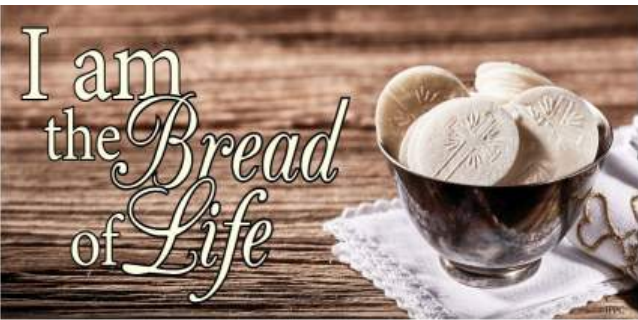
FIRST HOLY COMMUNION